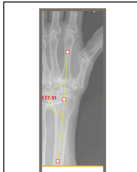
Fig. 2 Good Alignment