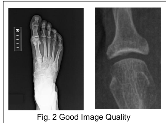
Fig. 2 Good Image Quality