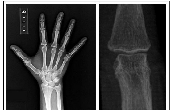
Fig. 3 Good Image Quality